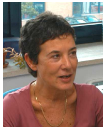
Image analysis with discrete tools