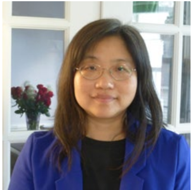
Tin Kam Ho, IAPR Fellow ICPR 2004, Cambridge, UK

For contributions to multiple classifier systems, statistical pattern recognition, document image analysis and recognition, and for service to IAPR.