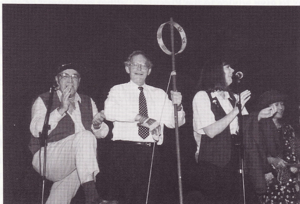
The new president hard at work during the banquet of the 14th ICPR!