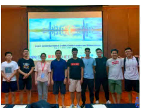
IICB 2021 Technical team in Shenzhen